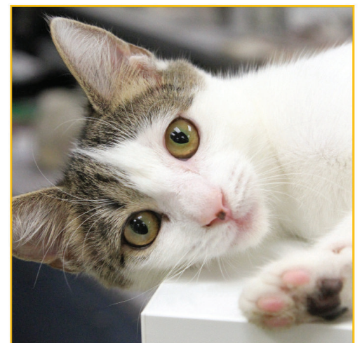
Georgette, Awaiting Adoption